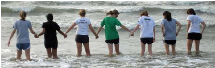
Band members enjoy the water during the American Classic Band Festival weekend in Corpus Christi