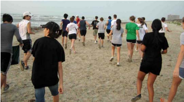
Band members wake up early for a four mile run on the beach